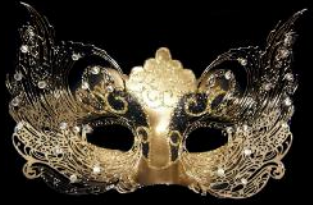
Colombina Luxury (filigree) ☐☐