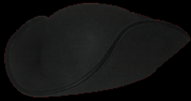
Tricorn Eco (size 58cm)