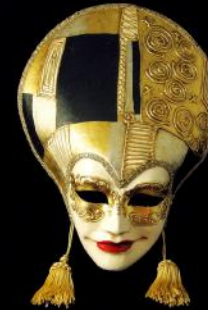
Liberty Art Deco