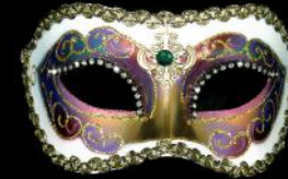
Colombina Arco Strass