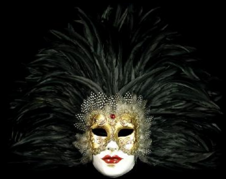
Volto Piume (large)