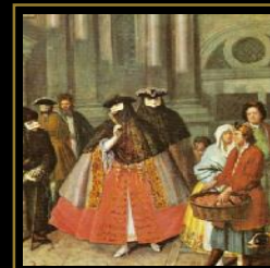
"Colloquio tra bautte" Pietro Longhi - 1757