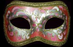
Colombina Decor Rococo