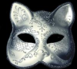
Gatb ☐ Decor Aria

All masks come fitted with ribbons which tie around the back of the head with a bow ☐☐ Most masks may be fitted with a stick, this option is available on the website shopping cart ☐☐