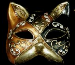
Gatb ☐ Rombe