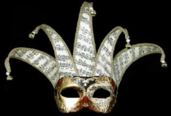
Colombina Jolly Musica