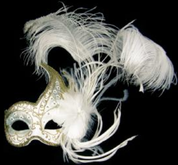
Colombina Cigno (The Swan)