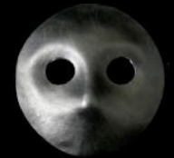
Moretta (m t e)