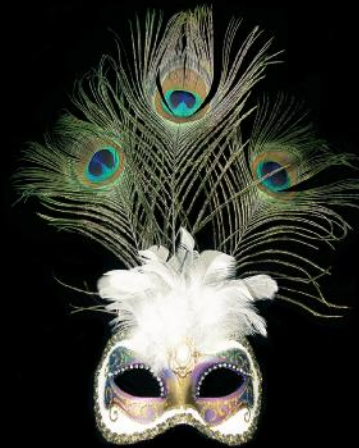
Festa Strass Fantasia