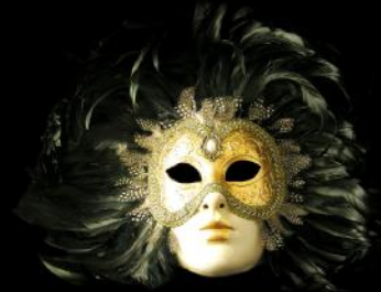
Volto Piume Sera