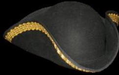
Tricorn Passamanerie (size 58cm)