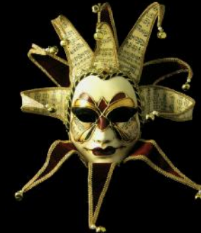
Volto Jolly Music Reale