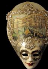
Liberty Pittira Piccola